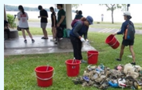
Care for Creation